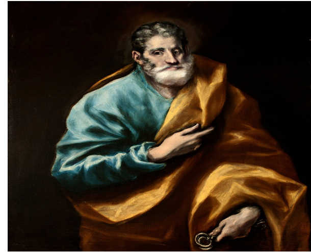
Apostle Peter – El Greco 1541-1614)