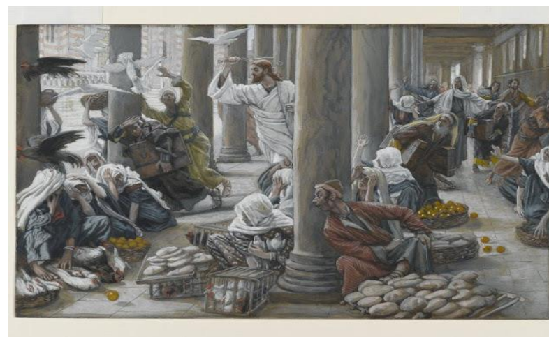
James Tissot The Merchants Chased from the Temple (1836-1906)