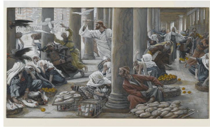
James Tissot The Merchants Chased from the Temple (1836-1906)

“Lent stimulates us to let the Word of God penetrate our life and in this way to know the fundamental truth: who we are, where we come from, where we must go, what path we must take in life.” -Pope Benedict XVI