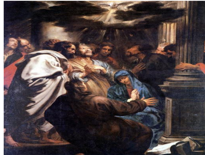
The Descent of the Holy Spirit – Anthony Van Dyck (1599-1641)

*You can prayerfully join this weekend's Mass broadcast on Sunday morning at 9 a.m. , following the link that will be sent via email or, alternatively, you can join by going directly to St. Mary Immaculate Elora YouTube channel