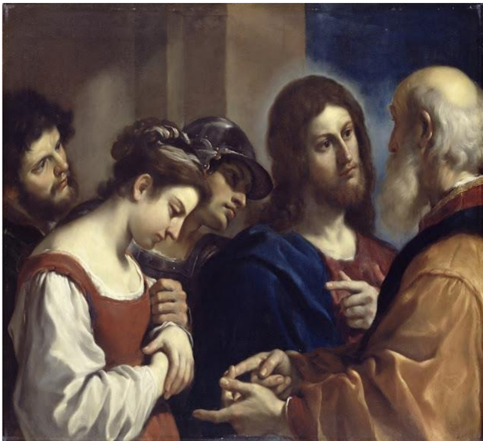
Christ with the Woman Taken in Adultery – Guercino (1591-1666)

Your generosity is very much appreciated!