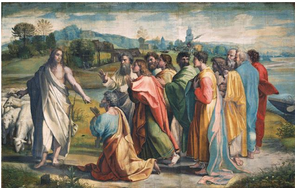
Christ's Charge to Peter – Raphael (1483-1520)

These retreats are on-site at Loyola House! Register online at loyolahouse.com or contact registration@ignatiusguelph.ca 519 824 1250 ext. 266.