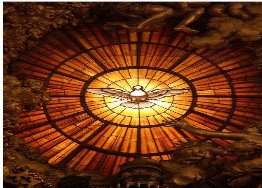
Dove of the Holy Spirit (Apse of St. Peter's Basilica) – Bernini (1598-1680)