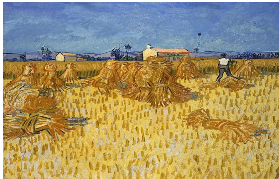
Vincent Van Gogh – Harvest in Provence (1853-1890)