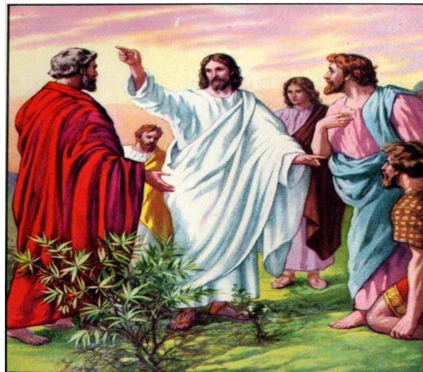
The Disciples Chosen and Sent Out – Artist Unknown

World Day for Grandparents and the Elderly