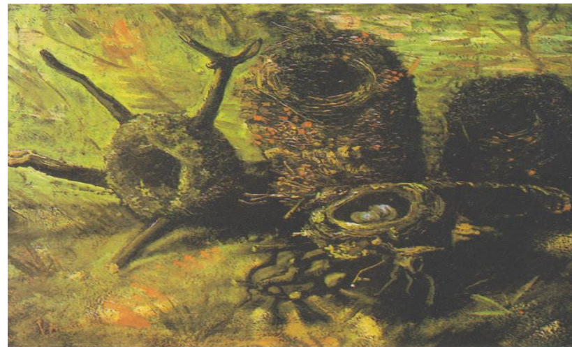
Still Life with Five Bird Nests – Vincent van Gogh (1853-1890)