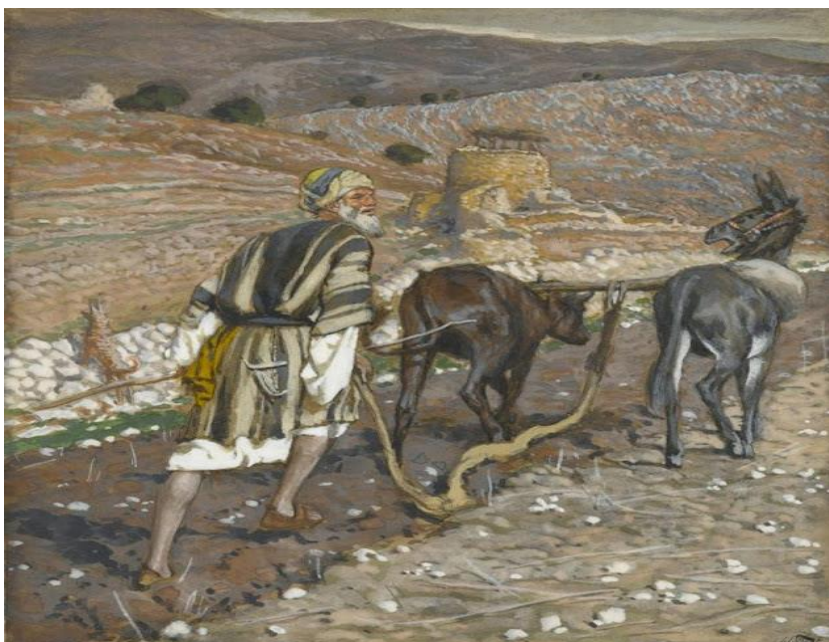
Looking Back – The Man at the Plough - James Tissot (1836-1902)

Those who walk the Guelph-to-Midland pilgrimage find it to be a unique and grace-filled experience. For eight days pilgrims pray, sing, laugh, and share stories with others as they journey. Join us, as we cast off routine for eight days and acquiesce to a community of higher purpose. Participate for 1 day, a weekend or the full 8 days! Cost $400 for 8 days or $75 per day. This covers 3 meals and snacks daily, entry fees and camping services. You bring your tent, chair and personal gear/clothing in a duffel bag. To register or for more information go to www.ignatiusguelph.ca (under programs - Guelph Walking Pilgrimage) NB registration deadline July 8, 2022.