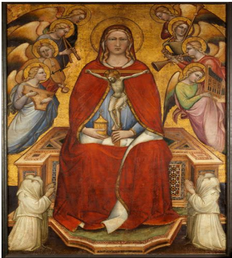
Aim to Be Saintly and Religious Spinello, Aretino - approximately 1395-1400

The Development and Peace/Caritas Canada campaign to assist the Pakistan relief program is available at www.devpc.org . All funds contributed will be matched by the Canadian government until September 28 th . Please be generous.