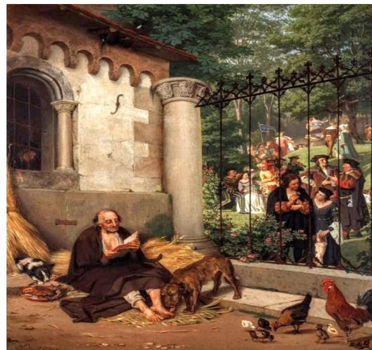
Lazarus and the Rich Man Eduard von Gebhardt (1838-1925)