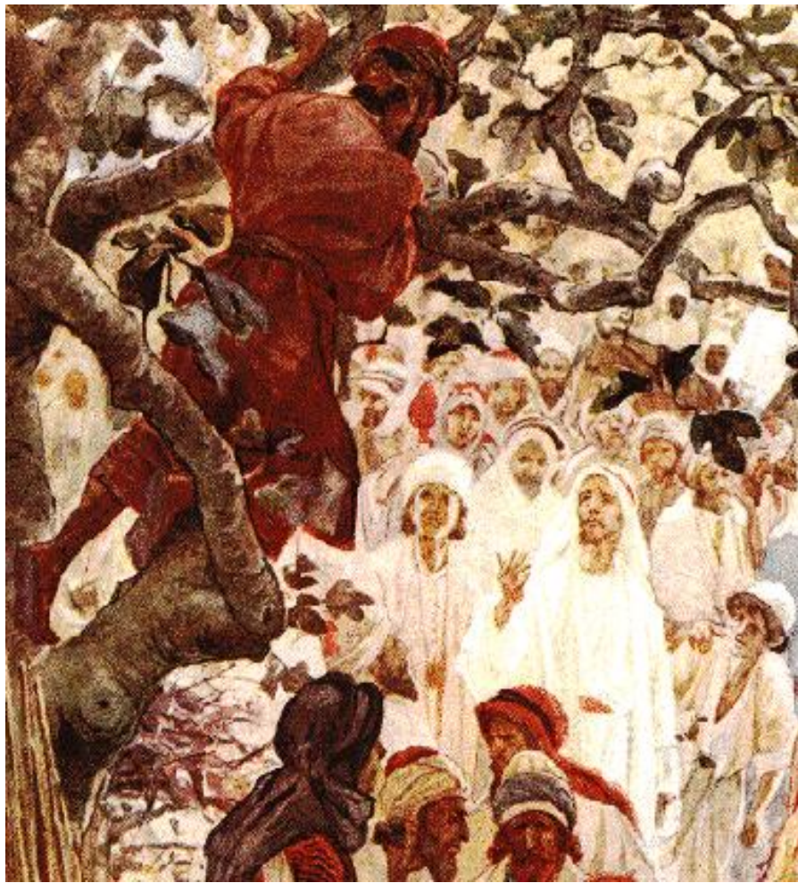
Zacchaeus Being Called Down from the Tree – Artist Unknown