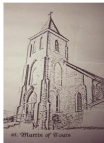
st. Martin of Tours