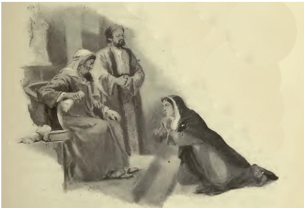
Widow and Judge (Anonymous)