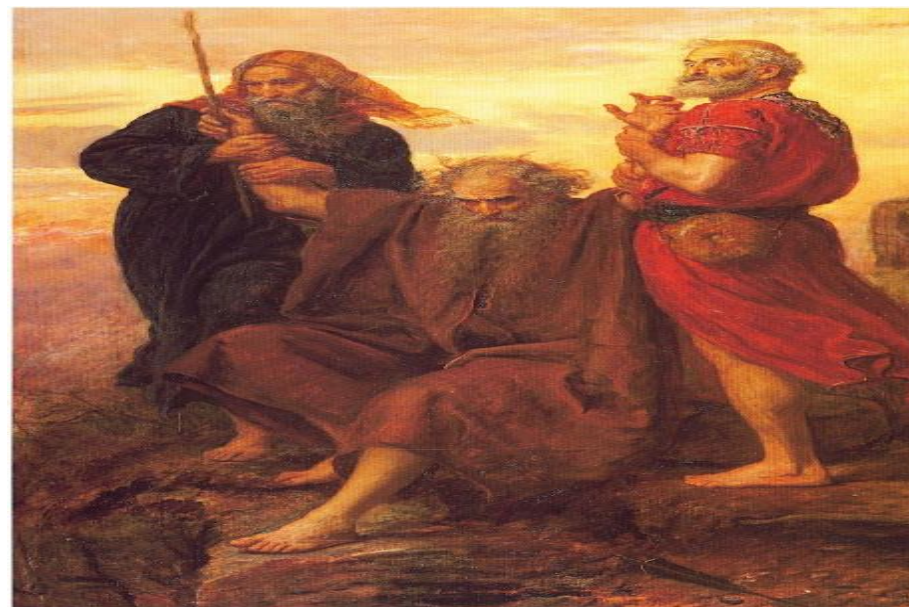
Moses Holding His Arms Up During the Battle, Assisted by Aaron and Hur John Everett Millais (1829-1896)