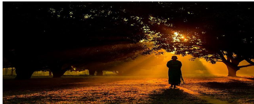
Walk in the Light

You are invited to a celebration of Advent on Sunday, December 4 from 3-5pm with the Jesuit Community. This gathering will be held at Loyola House (Ignatius Jesuit Centre), 5420 Hwy 6 N, Guelph. Light snacks and beverages will be available. We hope to see you there! For more information call 519 824 1250 or email reception@ignatiusguelph.ca .