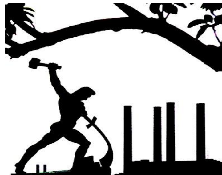
Swords Into Plowshares

Email: vocations@hamiltondiocese.com _____ www.hamiltondiocese.com/vocations/