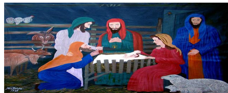
The Birth of Baby Jesus – Artist Unknown, England 1950s

The Wellington Catholic District School Board will be accepting registrations for kindergarten at our schools beginning January 9 th , 2023. Please see www.wellingtoncdsb.ca under registration for more details.