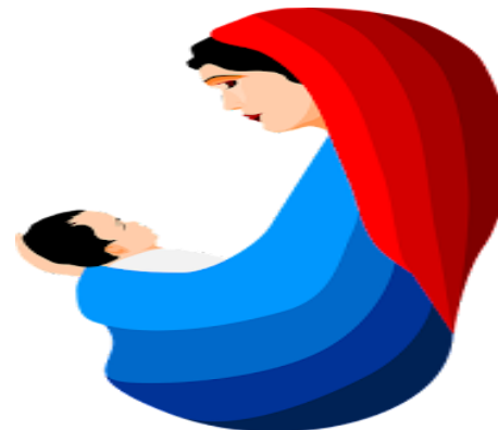
Mary and Jesus (Artist Unknown)