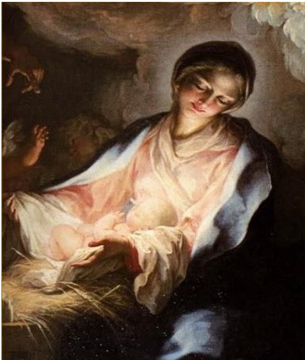
Madonna Mary And Baby Jesus Artist Unknown