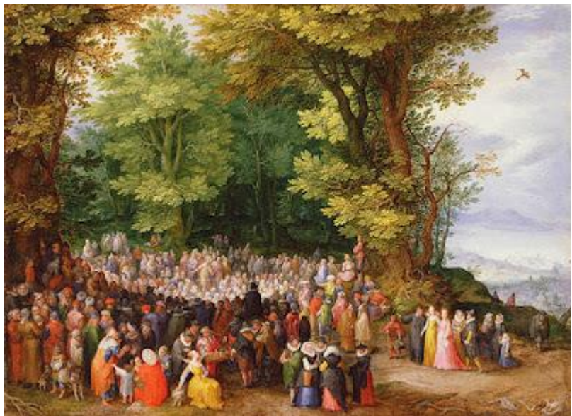
Sermon on the Mount - Jan Brueghel (1568-1625)

Are you interested in being involved in an organization committed to compassionate, high quality and equitable care? The St. Mary's hospital board is looking to fill two positions for the coming term. More information is available on the hospital website: https://www.smgh.ca/about-us/board-of-trustees/join-our-board-of-trustees