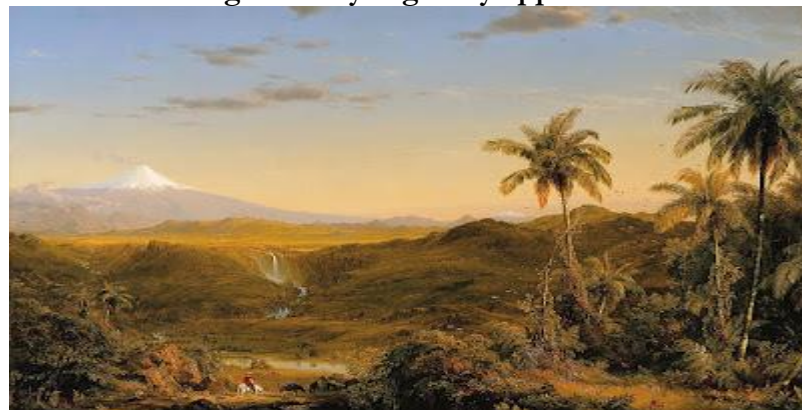
Jesus Went Up the Mountain - Unknown

“The word ‘happy’ or ‘blessed’ becomes a synonym for ‘holy.’ It expresses the fact that those faithful to God and his word, by their self-giving, gain true happiness.”