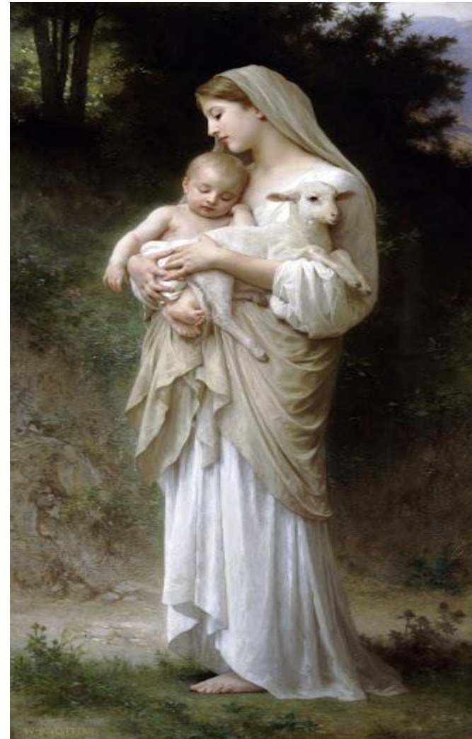
Behold the Lamb of God

St. Joseph's and St. Mary's Knights of Columbus council #15333 are having a Bottle Drive on Saturday, January 28 th from 10:00a.m. - 2:00p.m. The bottle and can drive will take place at St. Joseph's in Fergus, with all proceeds going to our community fundraising efforts in Fergus and Elora.