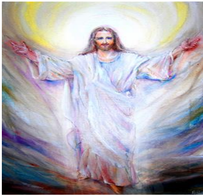
Jesus Christ the Light of the World, Unknown