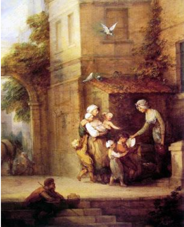
Charity Relieving Distress – Thomas Gainsborough (1727-1788)

Please join the St. Mary's and St. Joseph's Knights of Columbus in their monthly charity breakfast, every first Sunday of the month from 10am to 12:30am in the St. Joseph's parish hall. Come enjoy a full hot breakfast or just a cup of coffee and toast. All proceeds in aid of the Knights' local charity endeavours. All welcome.