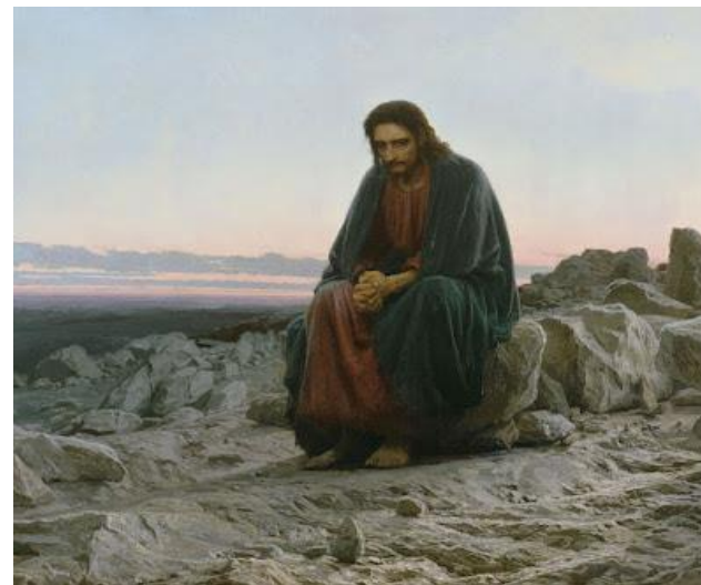
Christ in the Wilderness