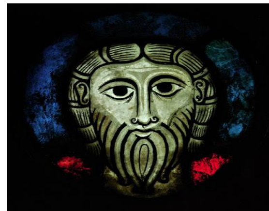
Christ de Wissembourg – Artist Unknown

The Knights of Columbus will once again be holding their Shrove Tuesday Pancake Supper on Tuesday February 21 in St. Joseph's Parish Hall from 5:00 to 7:00 p.m. Pancakes, syrup and sausages will be served along with coffee, tea, and juice. Free-will offerings will gratefully be accepted for the Knight's relief efforts in Ukraine. To date over $20M has been raised and over 3.2 million pounds of food supplied through the network of 7000 Knights in Poland and 2000 in Ukraine. And yet.... unfortunately, the need is greater now than it has ever been! Please join us for this social event before we begin our Lenten observance for this year.