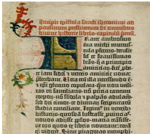
A Page from the Gutenberg Bible

The 40 Days for Life Guelph Campaign begins Wednesday, February 22, 2023! Unite together for 40 days of prayer, fasting and peaceful vigil. Learn more, get involved and sign up for prayer times by visiting 40daysforlife.com/guelph .