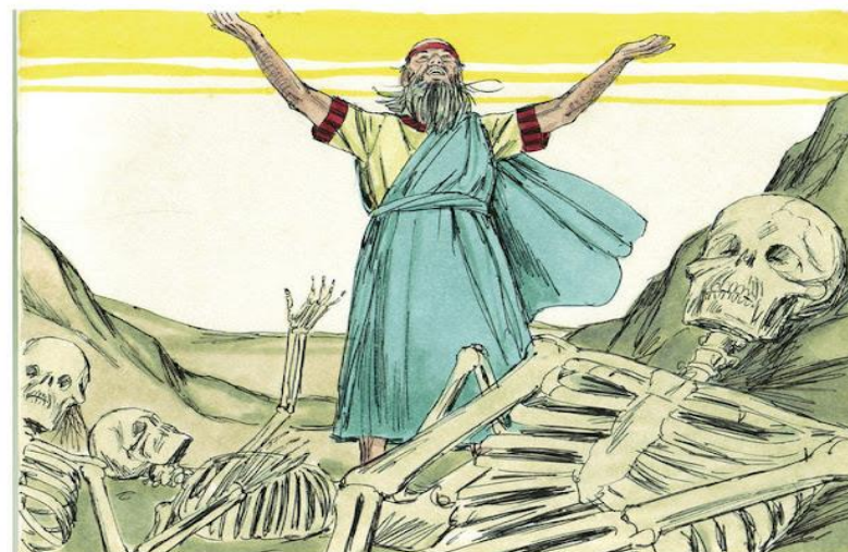
Book of Ezekiel – Chapter 37