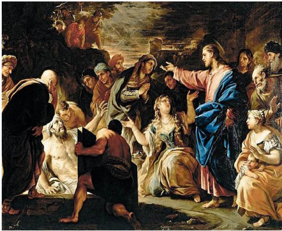
The Rising of Lazarus – Luca Giordano (1632-1705)