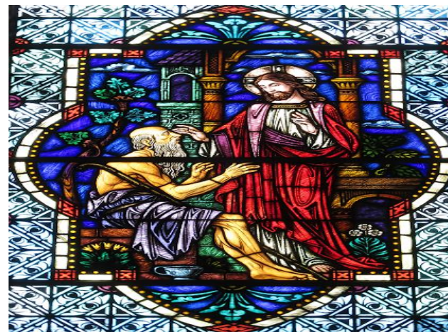
Christ Heals a Blind Man

The Knights of Columbus Council #15333 Fergus / Elora are excited to have our Annual Good Friday Fish Fry return this year. Please join us on Good Friday April 7 from 4:00pm - 6:00pm at St. Joseph's Parish, Fergus for a sit down or take-out orders for fish and chips with coleslaw. Cash only 1pc fish & chips dinner for $14 and 2pc fish & chips dinner for $19 with additional sides of your choice available as well. Proceeds will be directed to the Turkey / Syria Earthquake relief efforts. We look forward to seeing many of you return in support of our charitable efforts.