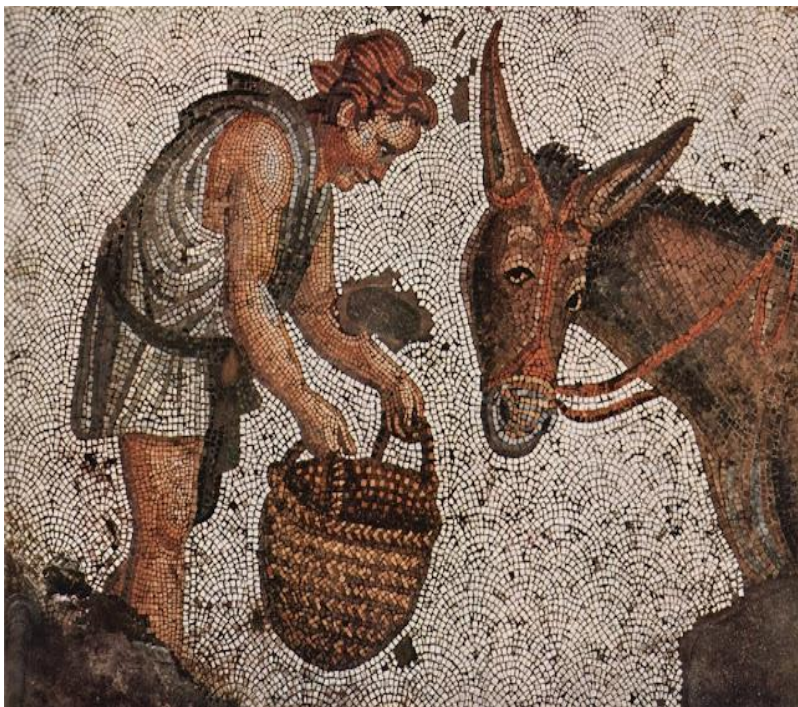
Byzantine floor mosaic from palace of Constantine the Great in Istanbul, Turkey, 5 th c.

St. Mary and St. Joseph Catholic Schools (Elora and Fergus) in conjunction with the Knights of Columbus Council 15333 are offering discount vouchers of $3 off per ticket. This is a great opportunity for our school and parish communities to get out to see some great hockey. You can purchase your tickets directly from the Guelph Storm box office online. Select April 4 th and 6 th vs Sarnia Storm and enter promo code: KofC23.