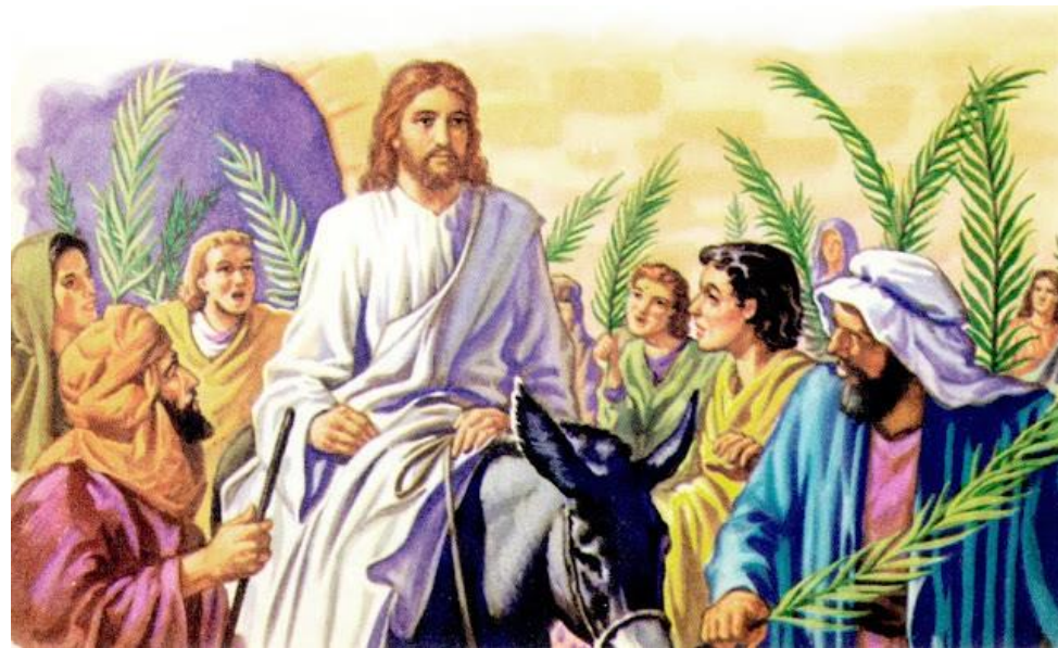
Entry Into Jerusalem – Artist Unknown

Book a seat on a coach bus, provided by Guelph & Area Right to Life, and join with thousands on Parliament Hill to demand protection for the most vulnerable members of our society. Please reserve your spot no later than May 1st by contacting the GARTL office. Guelph pick up and drop off location: Basilica of Our Lady parking lot, 28 Norfolk St, Guelph. Bus departure: Please be ready to board at 5:45 am in the Basilica parking lot. The bus will leave at 6 am sharp, arriving in Ottawa in time for the march. Bus return: Please be ready to board at 3:45 pm. The bus will leave Ottawa at 4 pm sharp, returning to the Basilica parking lot.