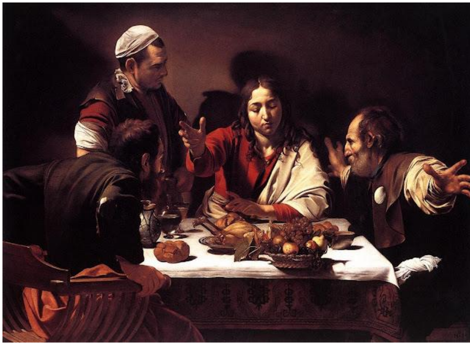
Supper at Emmaus, Caravaggio (1571–1610)