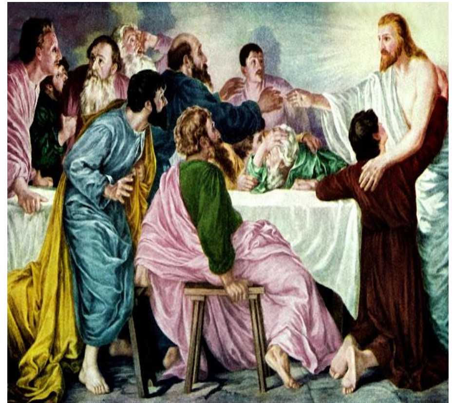
John 20 - Unknown