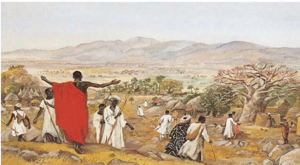
The Mission to The World, Jesus MAFA project