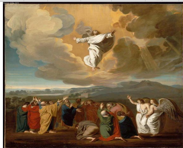
The Ascension - Copley John Singleton Copley (1738-1815)