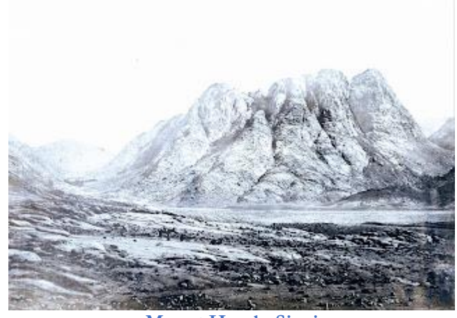
Mount Horeb, Sinai

vocations@hamiltondiocese.com/hamiltondiocese.com/vocations/