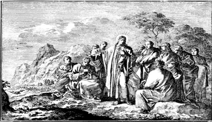
The Sparrows Discussed by Jesus, Jan Luiken (1649-1712)