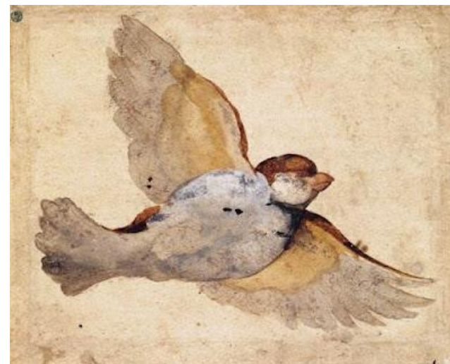
Study of a Flying Sparrow Giovanni da Udine (1487-1564)