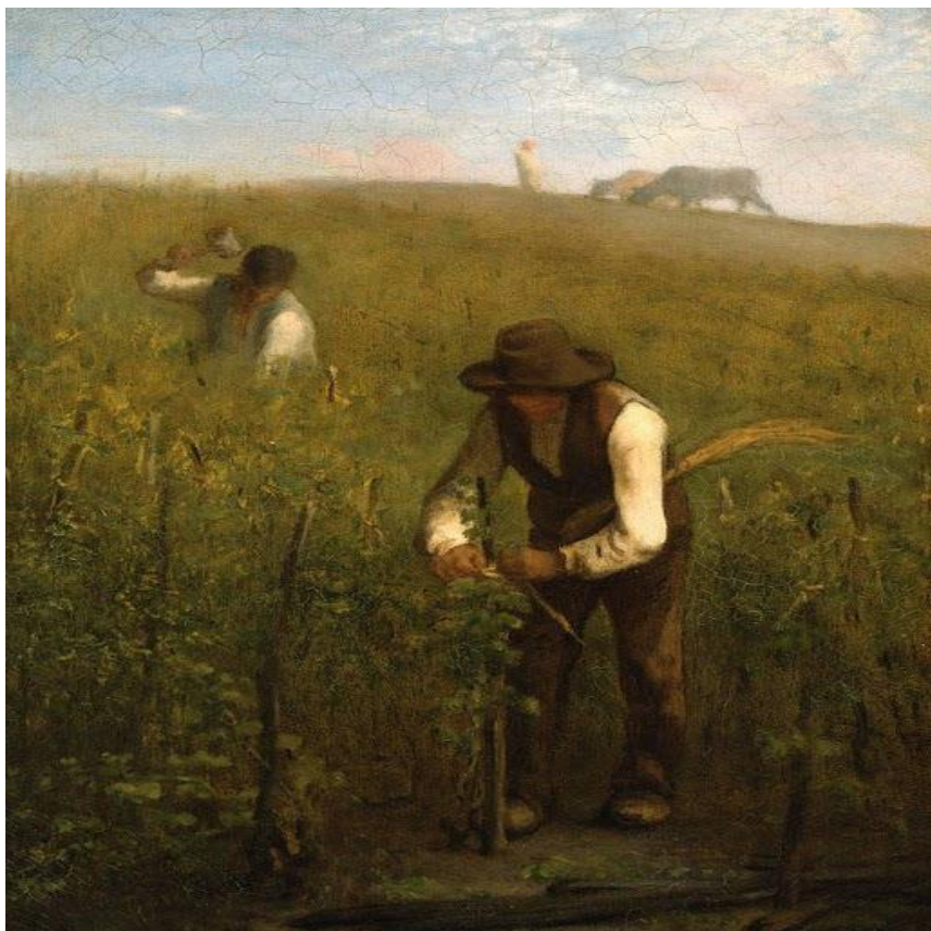
In the Vineyard – Jean Francois Millet 1814-1875