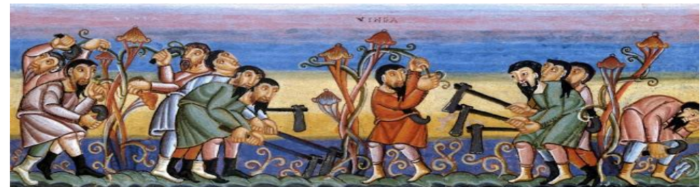
Parable of the Workers in the Vineyard from the Codex Aureus Epternacensis Artist Unknown, approx. 11th century

O Heart of Love, I place all my trust in thee. Although I fear my own weakness, I hope all things from thy goodness.