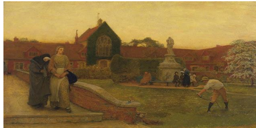
Harbour of Refuge, Frederick Walker (1840–1875)