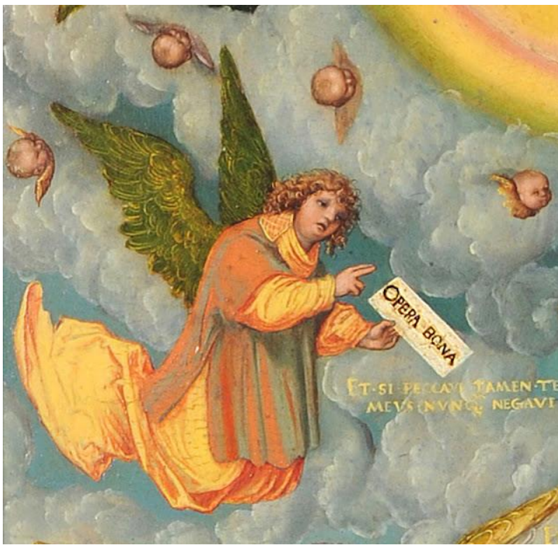
Good Works, Detail from The Dying Man , Lucas Cranach (1472-1553)