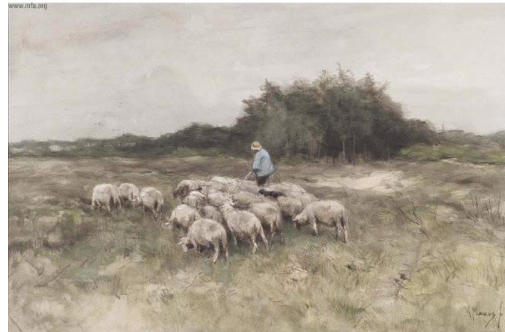
Landscape with Shepherd and Sheep , Anton Mauve (1838-1888)