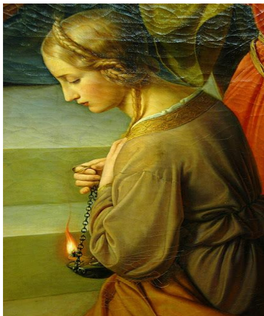
Parable of the Wise and Foolish Virgins (detail) Friedrich Wilhelm Schadow (1788–1862)