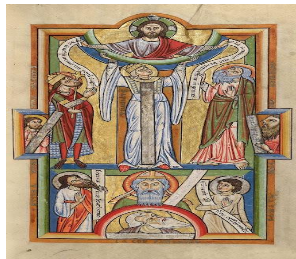
Wisdom - Unidentified – approximately 1170