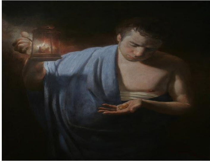
The Parable of the Talents – Andrey Mironov (2013)

The CWL will be supporting Guelph-Wellington Women in Crisis . by holding a donation drive on the weekend of Dec 9, 3:00 – 5:00 and Dec 10, 10:00 – 1:00. Donations can be dropped off in the back church parking lot. New items only, please. Donations gratefully accepted include personal care items, women's items, items for babies and children. A full list of items is found on the flyer posted by the front door. Merchant gift cards will also be gratefully accepted at CWL Christmas dinner on Dec 5 towards this drive.