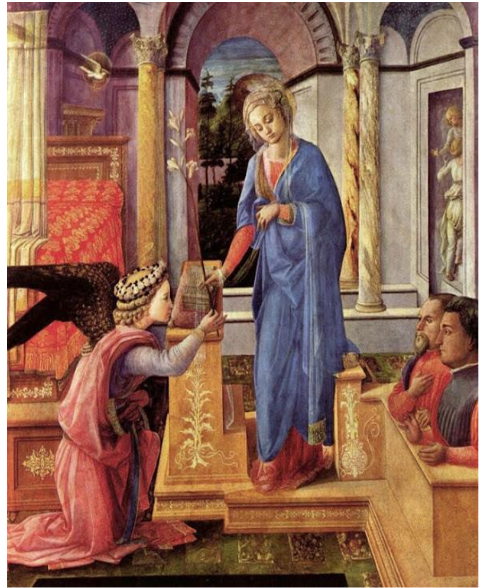
Annunciation – Filippo Lippi ca. (1406-1469)

William Hamilton (1751-1801) and Francesco Bartolozzi (1727-1815)