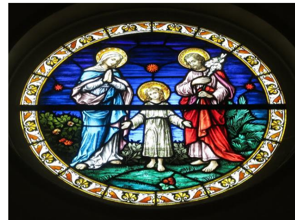
The Holy Family - Unknown