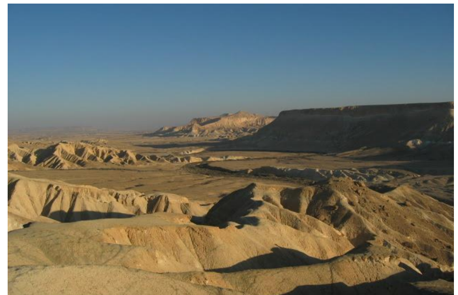
(Sand Mountains in the Negev artist: Roybb95)

Parishioners can also see the website for the full Christmas Mass schedule and Confession times www.stmaryimmaculate.com