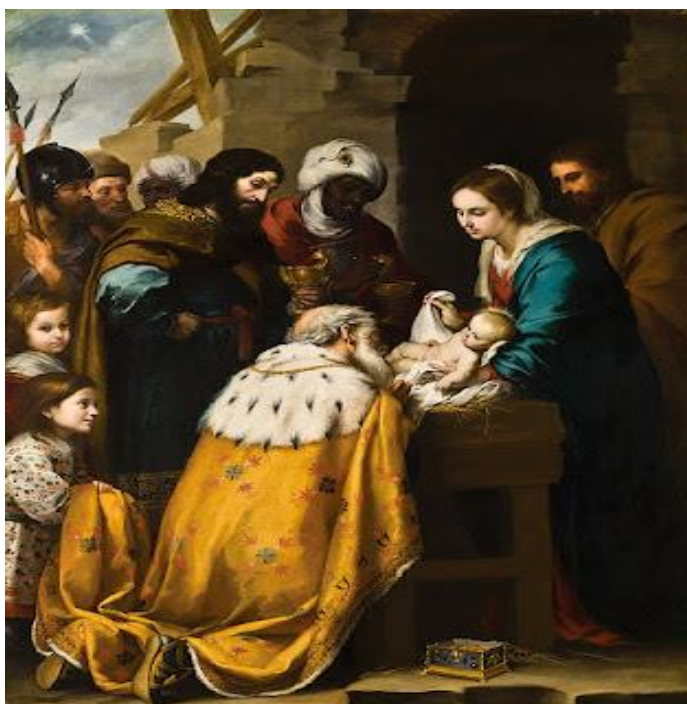
Adoration of the Magi – Bartolome Esteban Murillo

Your generosity, now and throughout the year, is very much appreciated!