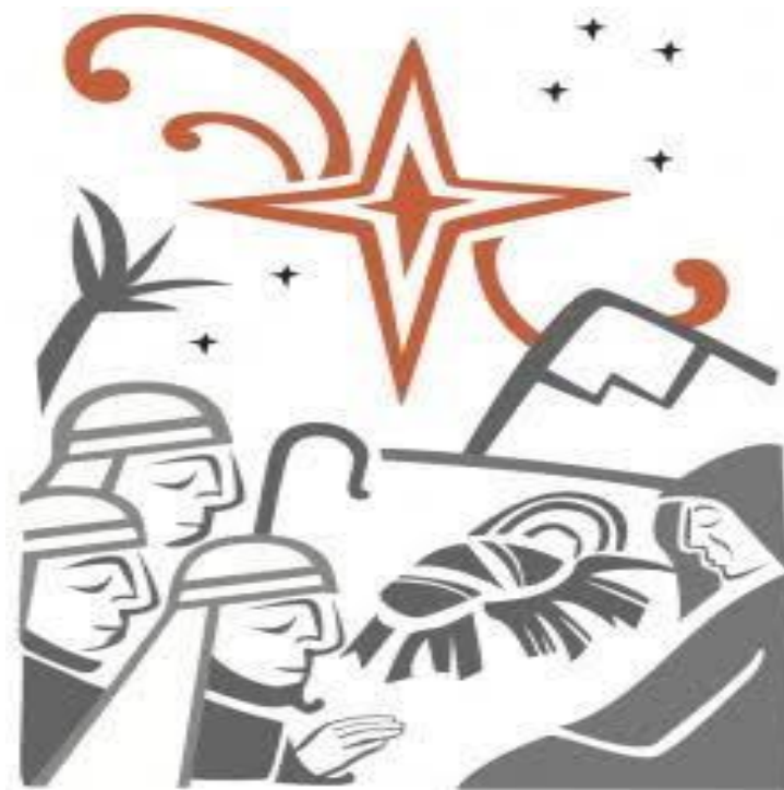
Wise Men at Christmas under the Southern Cross -Fitzbeck Creative of Wellington