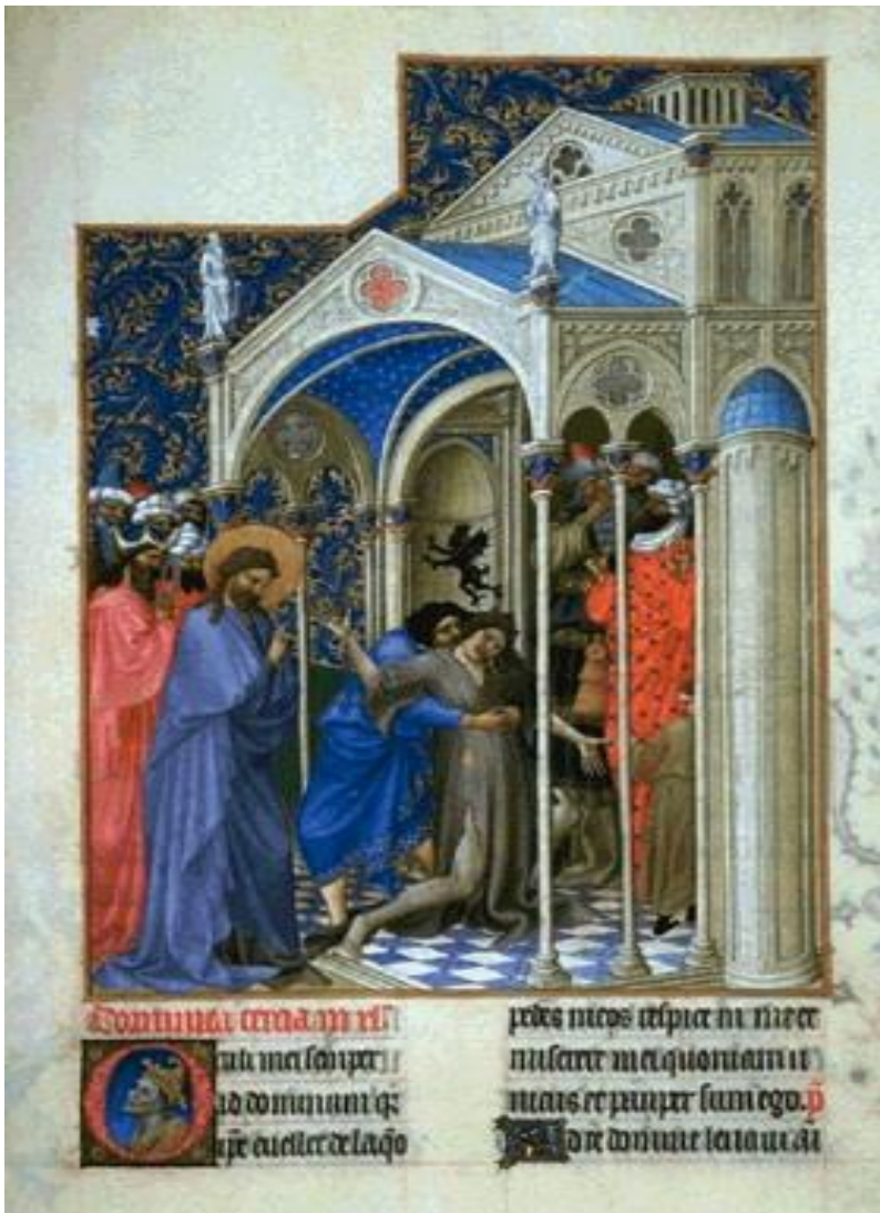
Jesus Casts Out the Unclean Spirit – Herman, Paul and Johan Limburgh (1412)