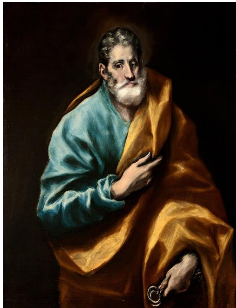
Apostle Peter - El Greco (1541–1614)

The Third Sunday of Ordinary Time (January 21, 2024) marks the celebration of Bible Sunday in the Diocese of Hamilton. At the conclusion of the Year of Mercy, Pope Francis encouraged every Christian community to choose one Sunday a year to renew its efforts to make the Sacred Scriptures better known and widely diffused. Our celebration of Bible Sunday is a call to listen to how #TheBibleSpeaks in our hearts and within our communities of faith. The Pastoral Offices of the Diocese of Hamilton have prepared a wide variety of resources for youth and adults in celebration of Bible Sunday 2024. Visit our website: https://hamiltondiocese.com/thebiblespeaks/ .