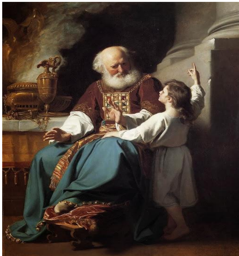
Samuel Relating to Eli The Judgements of God Upon Eli's House John Singleton Copley (1738–1815)