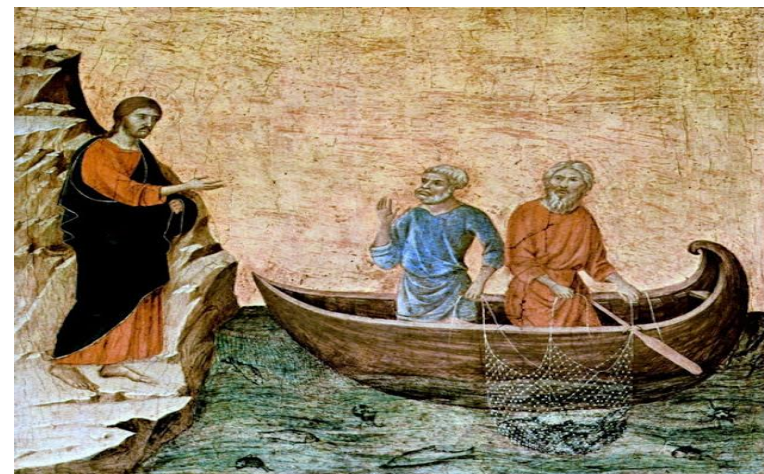
Christ Calling the Apostles Peter and Andrew – Buoninsegna di Duccio (d. 1319)