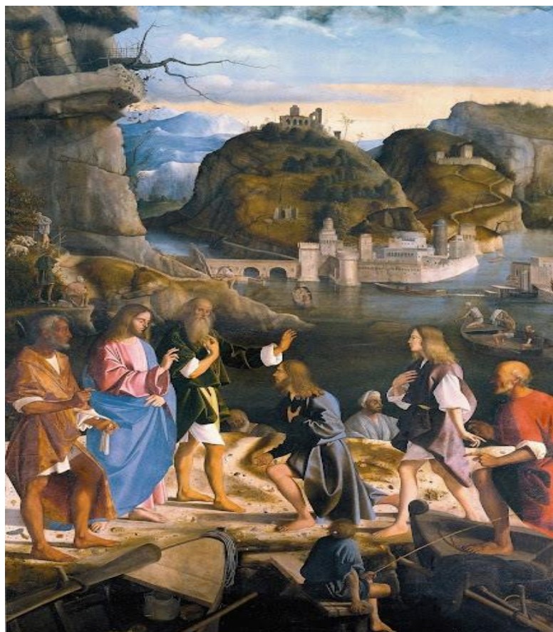
The Call of the Sons of Zebedee - Marco Basaiti (1470–1530)