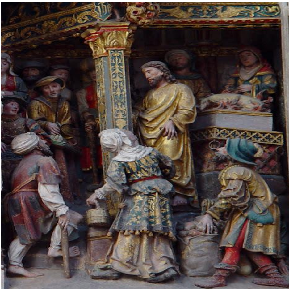
Jesus' Healing of the Lame in the Temple - Relief sculpture in Cathédrale d'Amiens, Amiens, France, built 1508-1519