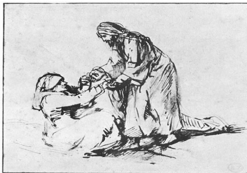
Christ Healing Peter's Mother-in-Law – Rembrandt (1606-1669)

N.B. A similar series will be presented in St. Martin of Tours Parish, Drayton, at a later date.