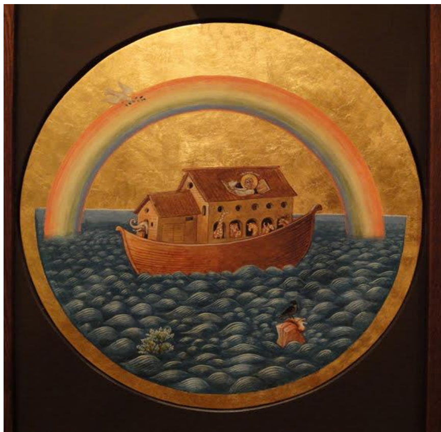
Noah's Ark Icon – From St. Nicholas Russian Orthodox Church, Amsterdam, The Netherlands