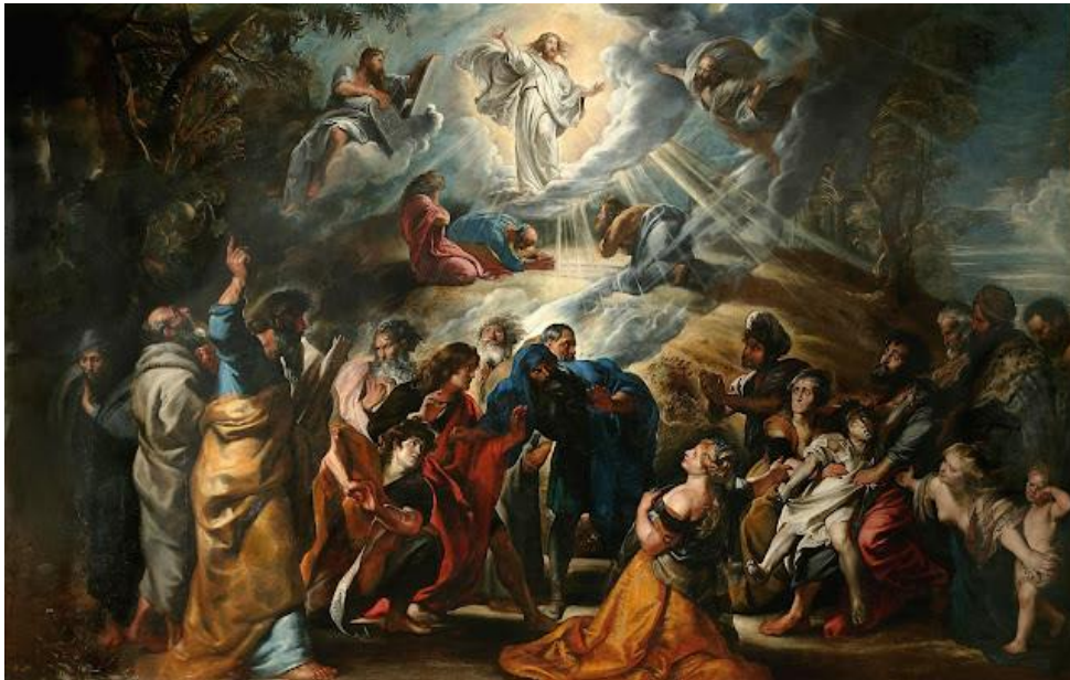
The Transfiguration – Peter Paul Rubens (1577-1640)

Are you a mother of babies, young, or school-aged children looking to meet up with other Catholic moms? St. John the Evangelist (45 Victoria Road North, Guelph) Mom's group meet once a month on the first Wednesday of the month from 4:30 till 6:00 p.m. We provide activities for the kids, supervised by a retired teacher, while we pray together, learn new parenting tips and tricks, and support each other. We are invigorated to go out and live our lives with purpose, having a new outlook and remaining hopeful for a better future. If you are looking for connection, purpose, a better outlook, for fellowship, and friendship, join us at our next meeting with your children. Our next meeting is Wednesday March 6 th at 4:30. We will be discussing the Sacrament of Confession. www.catholicmomsgroup.com