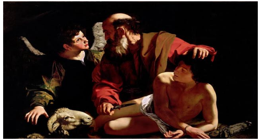
Sacrifice of Isaac – Caravaggio (1571-1610)