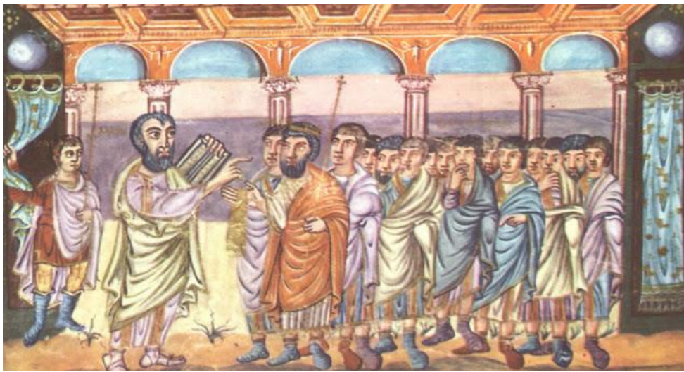
Moses Repeated The Commandments To The People Unknown Carolingian book illuminator c. 840