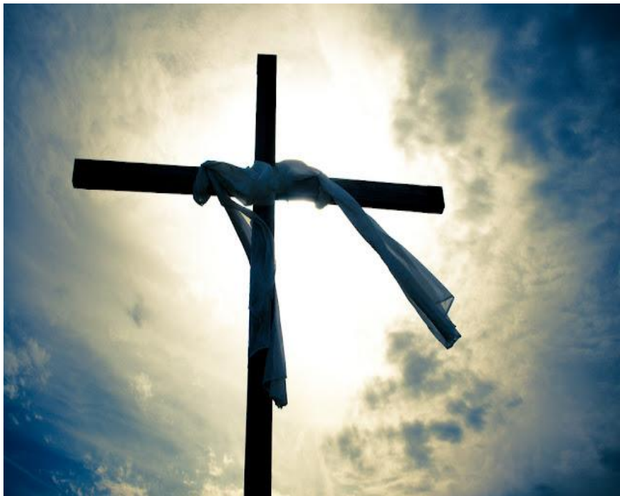
Empty Cross – Artist Unknown