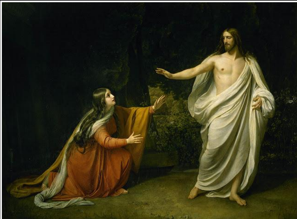
Christ's Appearance to Mary Magdalene After the Resurrection – Alexander Ivanov (1806 - 1858)