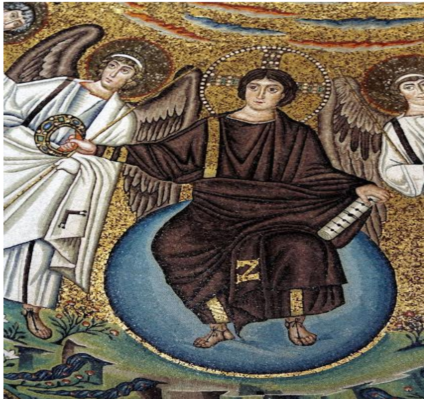
Christ in Glory – Mosaic in San Vitale, Ravenna

Marriage in the Catholic Church is a sacrament: our love for each other is to mirror the love of God for each person. When you look at your relationship, do you see it truly reflecting the total love and giving of God's love? Love is a choice and the decision to love can and should influence how we treat our spouses. When we purposely act in ways that reflect God's love our marriages are better and will then echo, through our relationship, a visible love showing God's invisible love to the world.