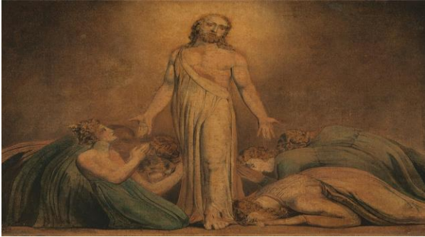
Christ Appearing to the Apostles After the Resurrection – William Blake (1757-1827)