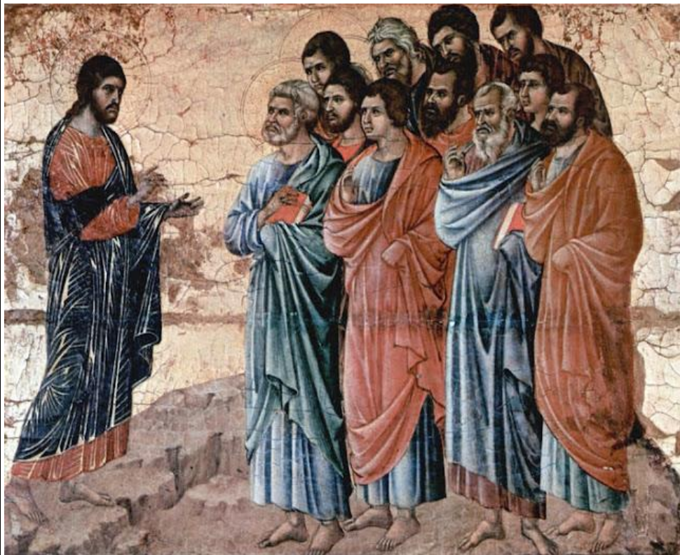
Christ Apperars to the Disciples on the Mountain in Galilee (Panel from the Maesta Altarpiece of Siena)